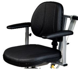
140-00247-02 black art leather

Seat 450x470mm / 18x19in, Backrest 360x410mm / 14x16in