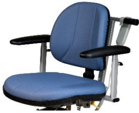
140-00135-00 blue vinyl

Vinyl has an airy, ventilated slick texture.