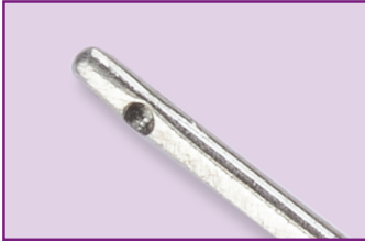
Tapered Tip, Port on Underside