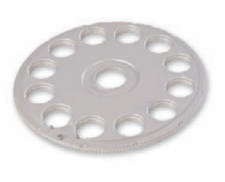
Precision machined, industrial strength aluminum lens dials